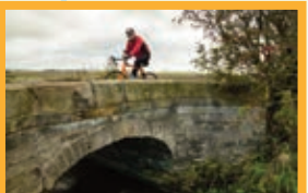
Sandy Way Bridge